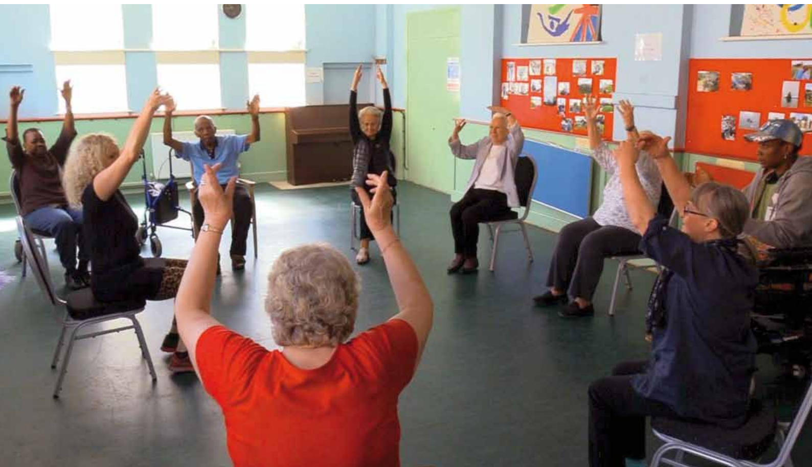
A chair exercise class in progress

Build stronger communities & campaign by working together with other voluntary and statutory organisations and community networks.