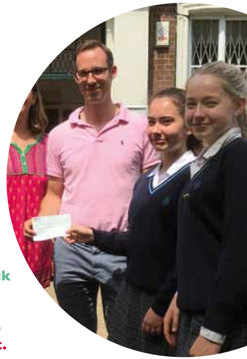
Francis Holland School pupils raised funds for KLS