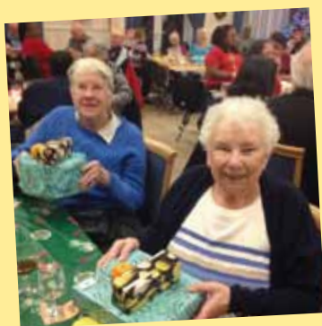
Elders' Lunch Club

Our current projects include: an Elders' Lunch Club; social support clubs such as The Contact Club; exercise programmes include yoga, T'ai Chi, line dancing, chair exercises for frail elders (with support from Wandsworth CCG-funded Community Resilience programme), Dance for Life with the Royal Academy of Dance; Gold & Silver Players drama group; arts and craft activities, pottery,