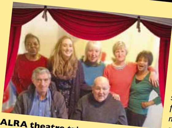
ALRA theatre trip

our elders with 33 of our members going along for the afternoon.