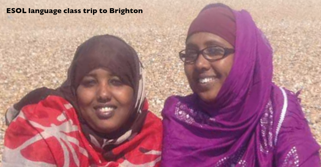
ESOL language class trip to Brighton