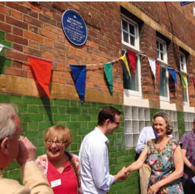
Unveiling of KLS Blue Plaque by the Mayor of Wandsworth at our 90th birthday party

We are truly fortunate in the dedication of staff, volunteers and trustees and the support of funders. Heartfelt thanks too to all who use the Settlement and make it so special.