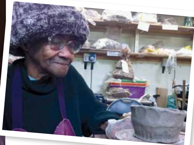
Above, a pottery class.