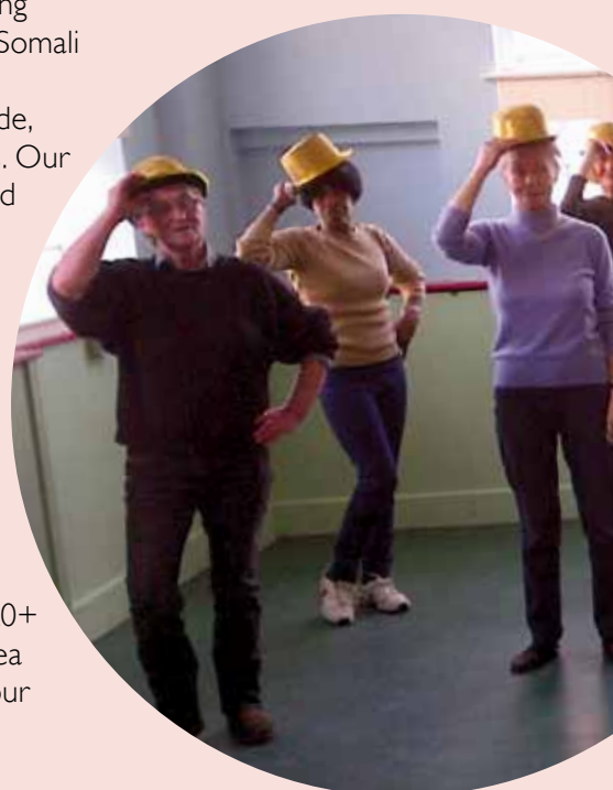
Left, Dance for Life group rehearsing

Over the year we worked with: 43 Contact Club/Little Club members; 4 people attend a monthly Mental Health Carers Group; 17 Somali Elders (through our exercise and sewing classes); 23 attended the Pensioners Lunch Club; 10 danced weekly with our Royal Academy of Dance tutor; 12 Line Danced; 8 attended Yoga; and 12 attended T'ai Chi for Elders.